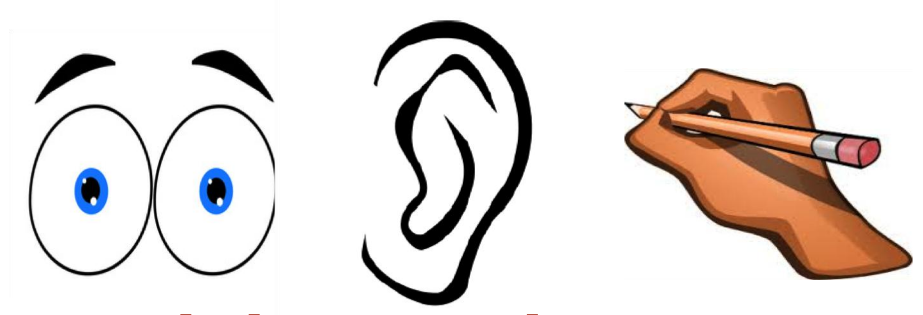
Look, listen, and write your answers!